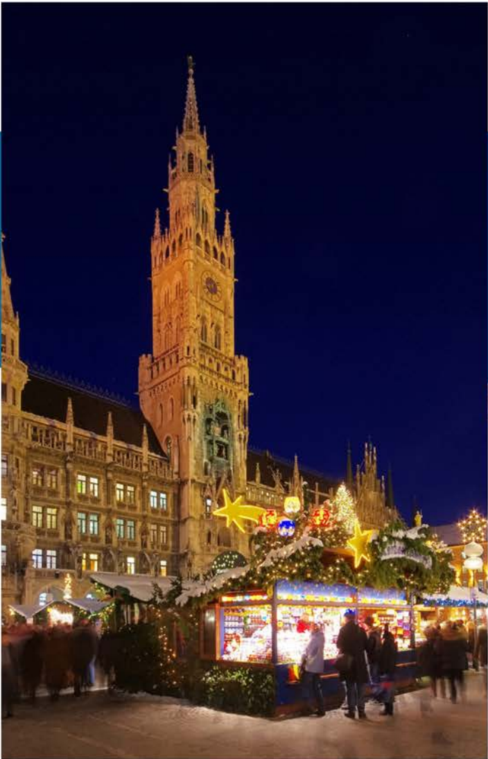
KX604 - OLD WORLD CHRISTMAS MARKET

Transfer to Munich Airport for your return flight home. (B)