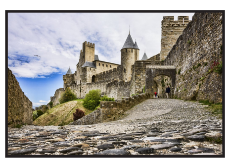
Overnight at Hotel Les Chevaliers (B, D)

DAY 7: CARCASSONE, FRANCE (A Journey into the Middle Ages) Wednesday, April 2, 2025 - After breakfast and checking out, embark on your journey to Carcassonne, a breathtaking medieval town known as La Cité, straight out of a fairy-tale. This remarkably preserved (and restored) fortified city offers an immersive experience into the Middle Ages and is recognized as a UNESCO World Heritage Site. Upon arrival, enjoy a walking tour of the city, starting with its most iconic feature: the double-circuit ramparts with 52 towers, a majestic sight that transports you back in time. As you explore, visit the Basilique Saint-Nazaire et Saint-Celse, famous for its stunning 13th-century stained-glass windows, offering a glimpse into the artistic beauty of the era.