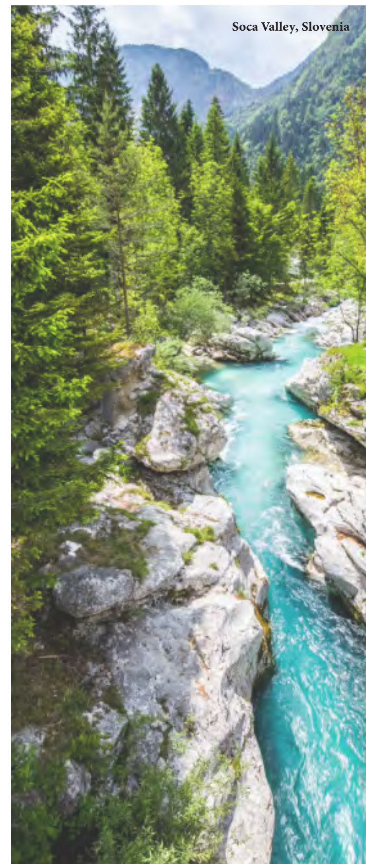
Soca Valley, Slovenia

Drive along the emerald-green Soca River, passing through Kobarid - featured in Hemingway's A Farewell to Arms . Visit the WWI Museum, before continuing to Bled. On the way, stop to visit the Boka Waterfall viewpoint. (B)