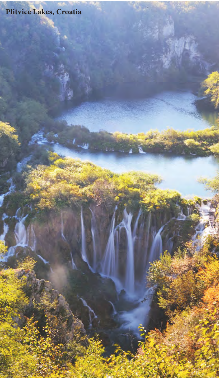
Plitvice Lakes, Croatia